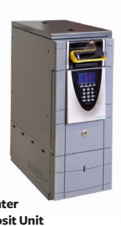
Counter Deposit Unit

Remote unlocking of (parts of) the safe by CIT or HQ allows controlled onsite support.