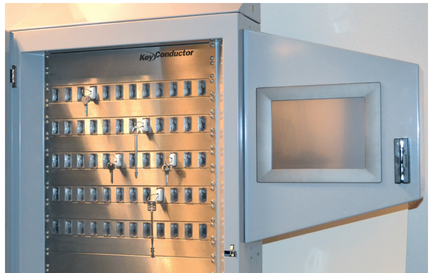
The KeyConductor enables easy storage and orderpicking of sets of keys.

If there is a change of liability required between the employee and the driver whilst handing over the keys, then the KeyCaptor can be used. Also in that case, CWC communicates the required keys and the KeyCaptor checks if the right key-rings are being issued and a change of liability is printed. Besides the