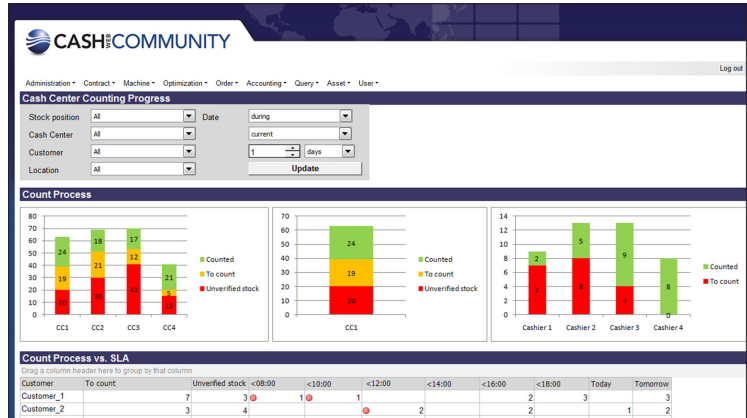
Inbound processing view. Progress of the counting process with client SLA alerting.

The software integrates with several commonly used counting & sorting machines and is able to automatically capture counting results.